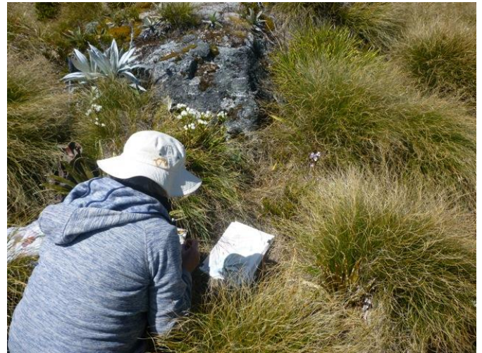
The author settling into the tussocks to portray pink gentian flowers and Celmisiafoliage . Her painting is printed on the following page.

When the photographs had been taken I knelt down, opened my watercolour kit, spread out a piece of white rag paper to pay my own obeisance.