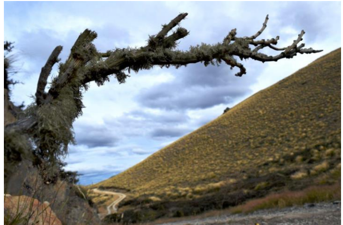
'Broom Stick' (Gregory T. Nelson)

The second commendation for plant portrait was a skyward view of a stalk of coral broom ( Carmichaelia crassicaulis subsp. crassicaulis , Gregory T. Nelson). The picture had nice composition being made up of multiple triangles formed by the sky and hillside in the distance, as well as the rocks beneath the plant in the foreground. The tips of the plant are in focus, catching the viewer's attention, which is then drawn down the stalk to the ground and through the rest of the photo. This picture really demonstrates that humble plants can be great subjects for good work given correct perspective and composition.