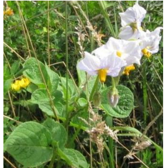
Solanum tuberosum at John Bull's Gully.