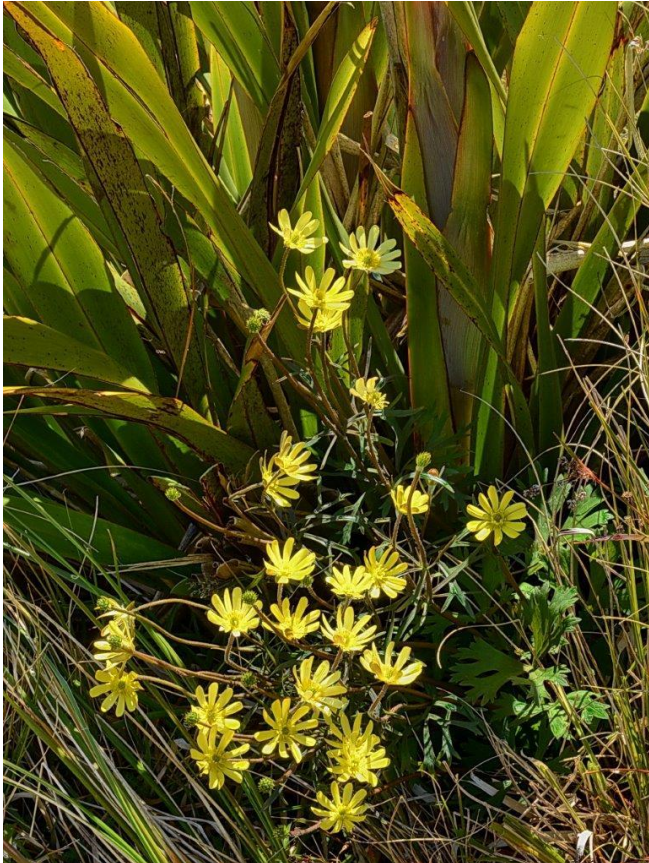
'Floral Arrangement ( Ranunculus verticillatus ) (David Lyttle)

in the leaves. Additionally, although the flowers repeat they are in different orientations which calls to observer to look at each one individually. The eyes are initially drawn to the cluster near the bottom and then move upwards to this end.