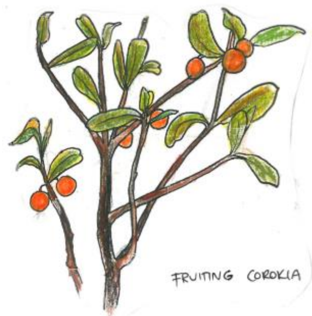
original drawing by Dave Kingan https://davekingan.com