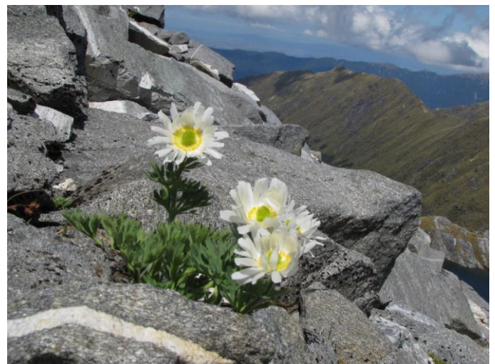
Ranunculus buchananii growing higher up the mountain.