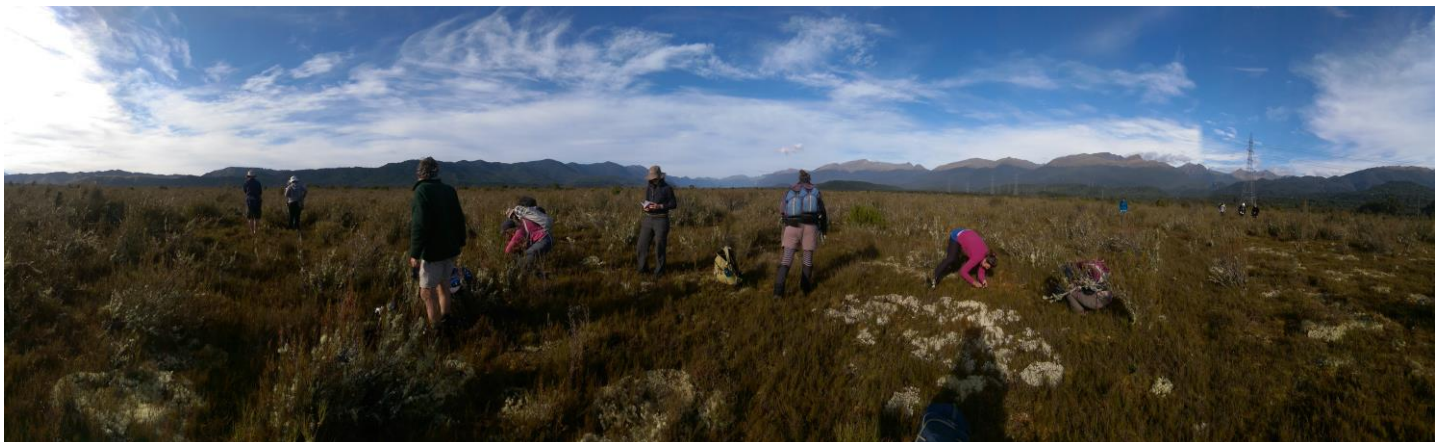
Bot soccers divaricate to examine botanical treasures in the vast Borland bog.

The call of the nearby forest was a bit too much for some and the group started to break up after a couple of hours as some members headed for the trees. Nevertheless it was a pleasant start to the day and a good wind down after the excitement of the previous day's adventures on Mount Burns.