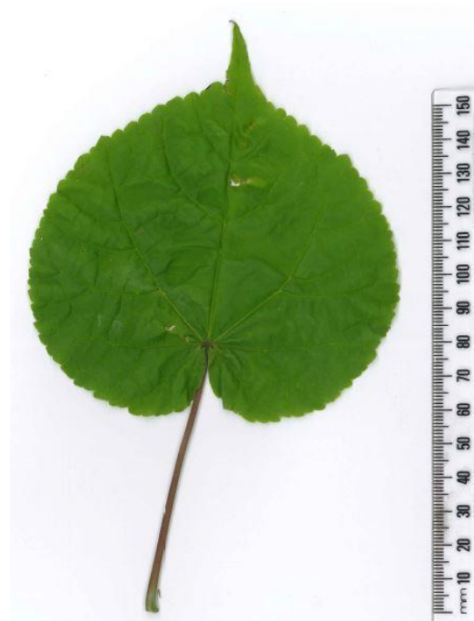
adaxial surface of leaf (Photo: John Steel).

What can you do? If you find it, or even something like it, don't remove it, mark the spot somehow and report it to the landowner or your local Regional Council so they can put in place effective practices.