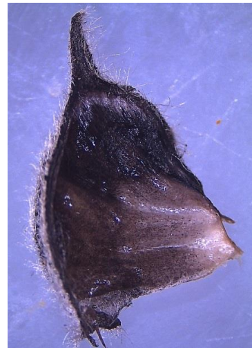
Abutilon theophrasti camarium (Photo: John Steel).

similarly deal to the edges of home-made pies. It has many common names (58 at my last count), only nine of which contain the word, weed; the rest cover a variety of practices, uses and descriptions depending on the interests concerned, all favourable. It has been domesticated in China from early times where it produced valuable fibres for hemp- and jute-like products and was introduced to North America in the mid-1700s. The leaves are (or were) a popular food in China and India and, apparently as an ingredient in the national dish of the Maldives (thank you Google – until now I never even knew they had a national dish, or even a dish of any kind for that matter). Oh yes: you now know it as velvetleaf.