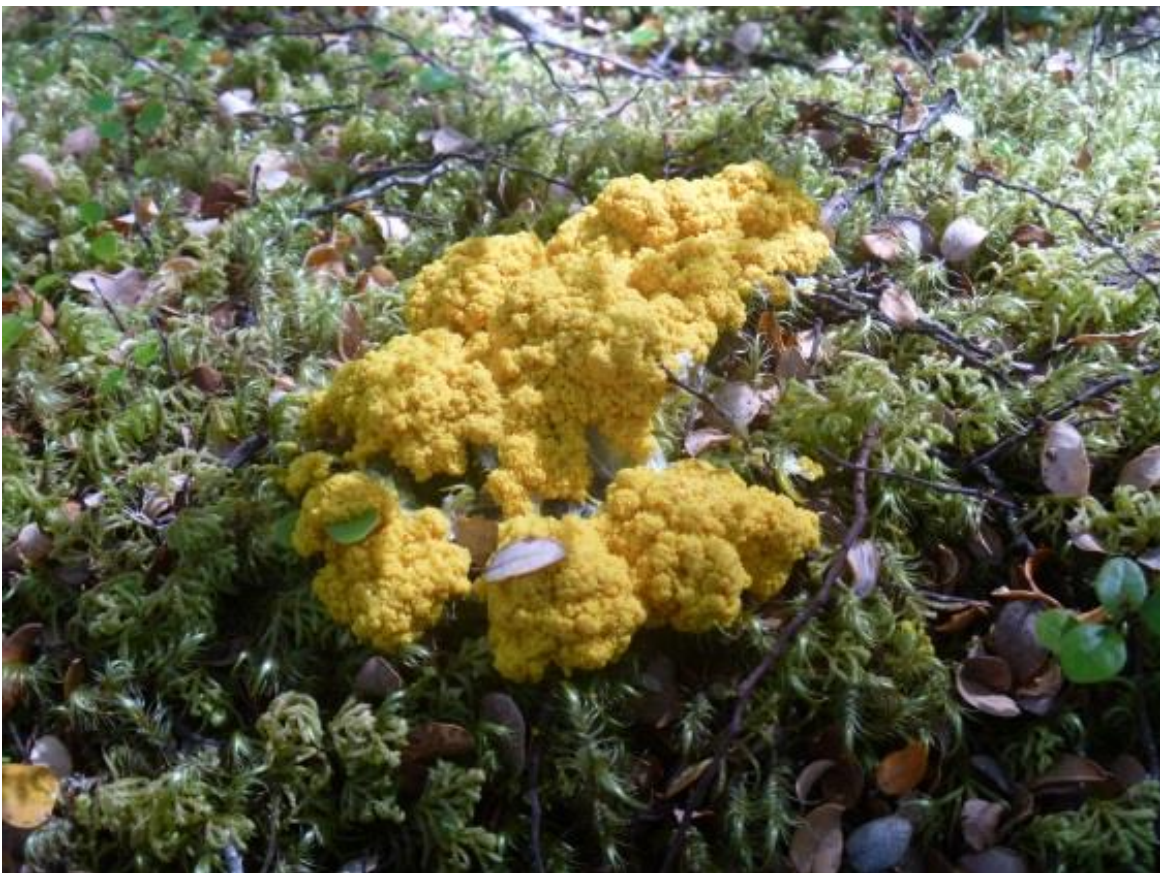
Fuligo septica

A slime mould ( Fuligo septica ) growing over the moss groundcover was the highlight of the lakeside growth. It looked like a cauliflower, with its bumpy surface (I'm not convinced by the usual comparison to dog-vomit) and had a sticky texture which didn't quite match the appearance when (naturally) we prodded it. Fuligo septica is a Myxomycete which tends to grow on rotting wood. It moves along the ground slowly and engulfs its food.