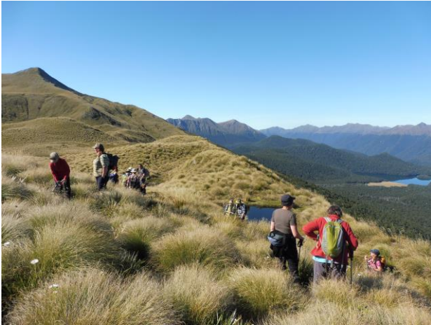
fossicking amongst Southland's endemic Chionochloa teretifolia .

observing dracophyllums and celmisias in their natural habitat and taking in the truly astonishing mountain views.