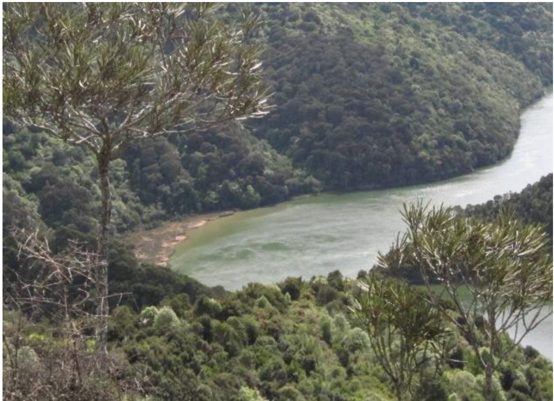
Sub-adult Pseudopanax ferox keeping watch over the native bush covering the sides of the gorge.