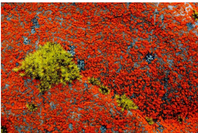
'Free Living Algae' (Gregory T. Nelson)

The winner of other botanical subject depicted a flat rock face covered in free living algae ( Trentepohila spp., Gregory T. Nelson) along with moss and some lichen. The photo had nice contrasts in terms of color (orange vs. green) as well as textures (rough and mottled vs. soft and spiky). Compositionally, the various lines created from cracks in the rocks work to move the observer's eye throughout the photo. Moreover, it tells a story of how even diminutive plants fight hard for space and other resources.