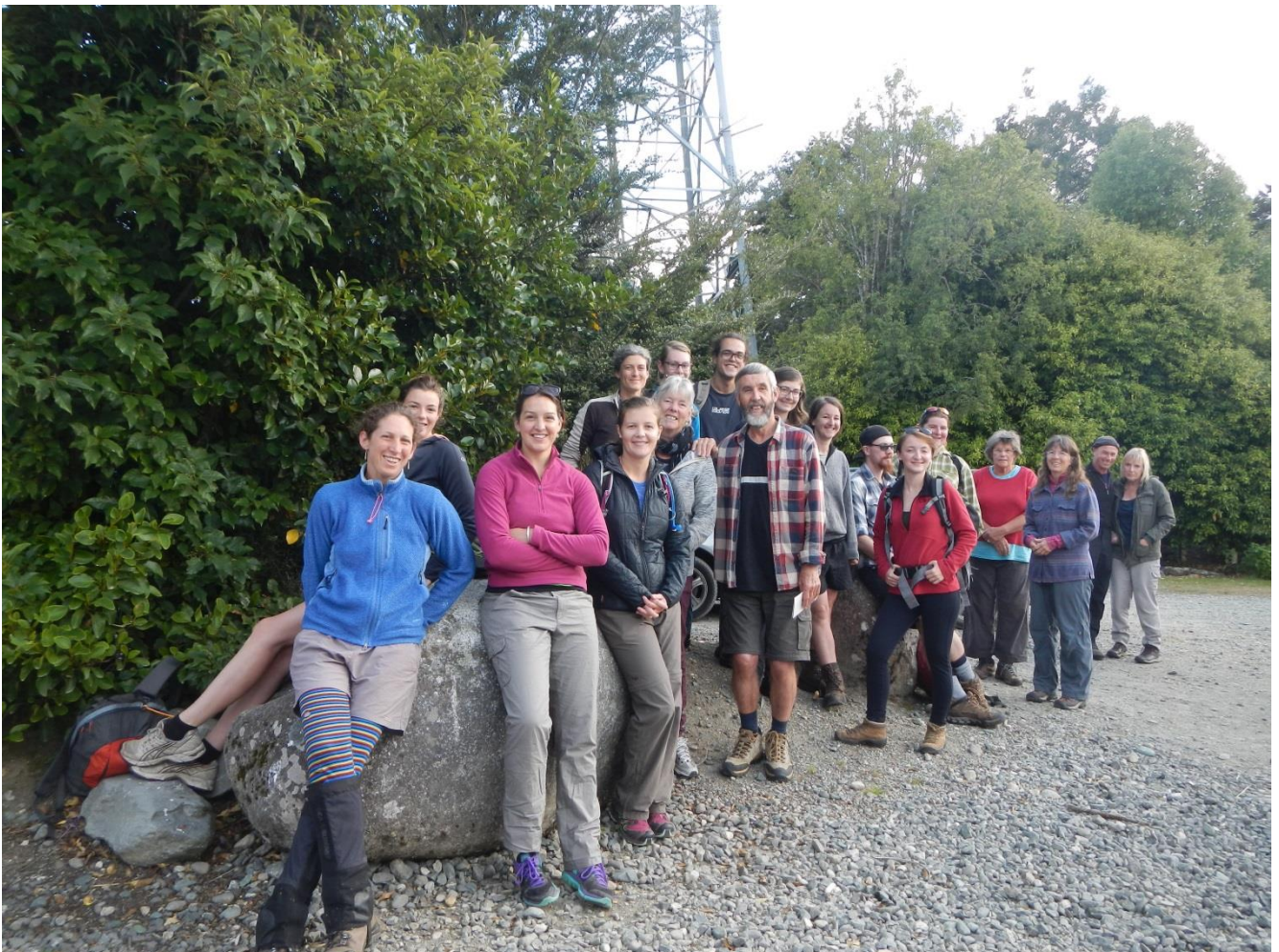
Participants in BSO's February field trip pose for a photograph at Borland Lodge before venturing out to Mt. Burns for the day (Photo supplied by Gretchen Brownstein).

the responsibility of each person to stay in contact with the group and to bring sufficient food, drink and outdoor gear to cope with changeable weather conditions. Bring appropriate personal medication, including anti-histamine for allergies. Note trip guidelines on the BSO web site: http://www.otago.ac.nz/botany/bso/