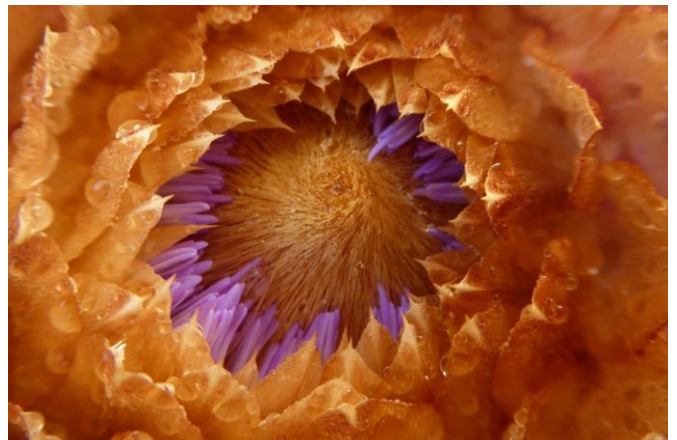
'Centre of the Globe' (Cara-Lisa Schloots)

The winner of the portrait category was a close up shot of a flower belonging to a more charismatic plant ( Protea sp., Cara-Lisa Schloots). This photo has it all – color, texture, depth. The center of the opening flower is especially entrancing. Even though the focal subject envelops the centre, it isn't in the exact centre and is asymmetrical - thus allowing the observer to move through the rest of the photo.