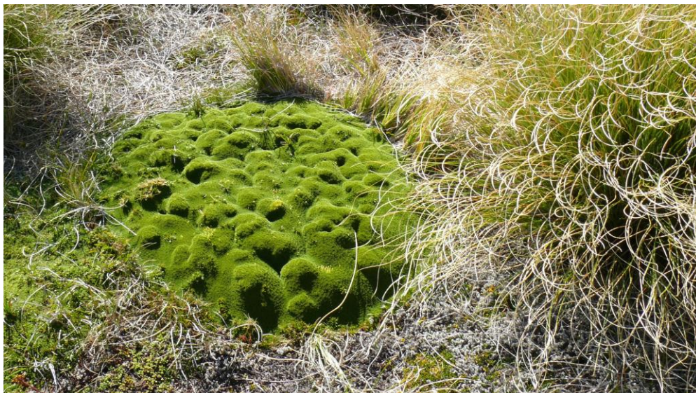
Donatia novae-zelandiae and Chionochloa teretifolia on Mt. Burns.