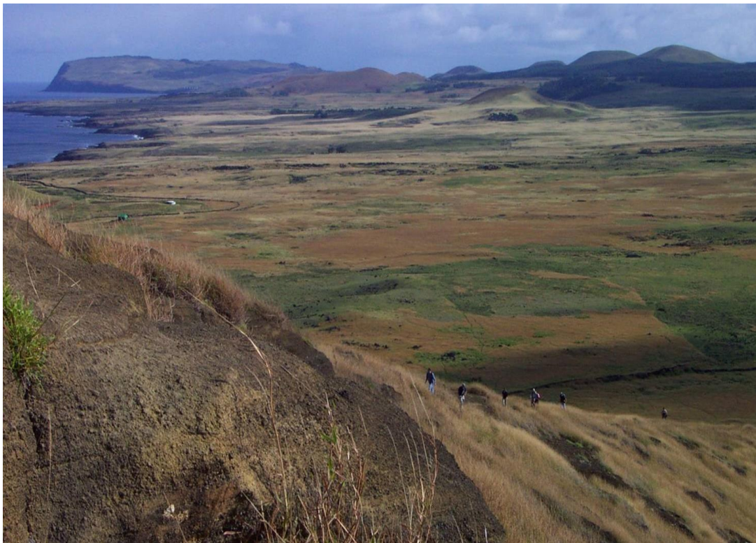
the rather desolate looking landscape on Rapa Nui.

picture of the starchy diet dominated by sweet potato. Phytoliths from the extinct palms were a mystery until she realised that they were probably picked up from the soil the plants were growing in. Monica also studied the plaque and deduced the plant diet of the Lapita people from a 3000 year old cemetery in Teouma, Vanuatu. When they colonised Remote Oceania from the west these fascinating people brought with them their distinctive pottery along with chickens, rats, pigs, bananas, yams and taro. They also ate fruit, ginger, bats and extinct turtles as well as medicinal bark, Malay apples, sponges and sea grass. The very limited diet of the colonists on Rapa Nui 500 years ago was in stark contrast to this richly varied diet of their potential ancestors. Altogether an extraordinarily interesting talk with much food for thought. Thank you Monica.