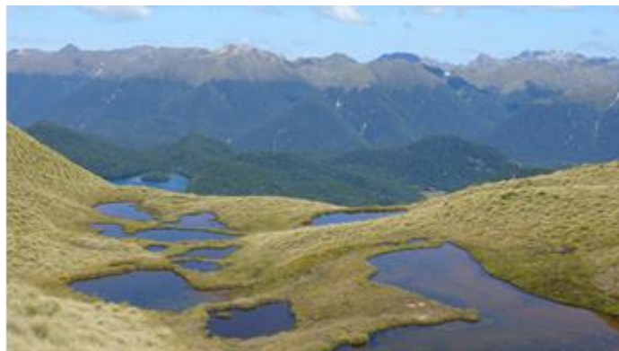
Unnamed tarns on Mt Burns, looking Southwest toward Island Lake and the Grebe valley.

root. In just 15 minutes we emerged out into bright tussock lands above the trees.