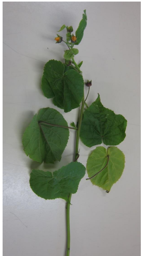
Abutilon theophrasti.