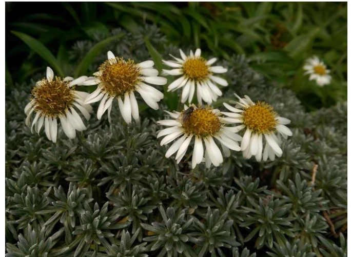
Celmisia hectori