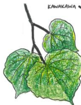
Piper excelsum (drawing by Dave Kingan)

weed. By the time the next newsletter comes out I should have been to the northern hemisphere and seen it in its 'native' context and maybe seen some New Zealand natives in their 'weedy' context too!