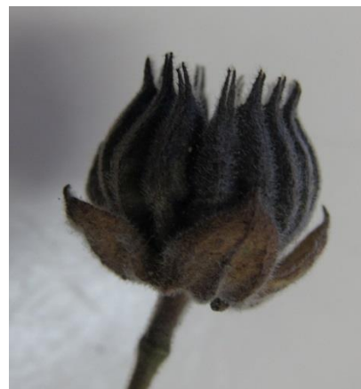
A.theophrasti schizocarp.