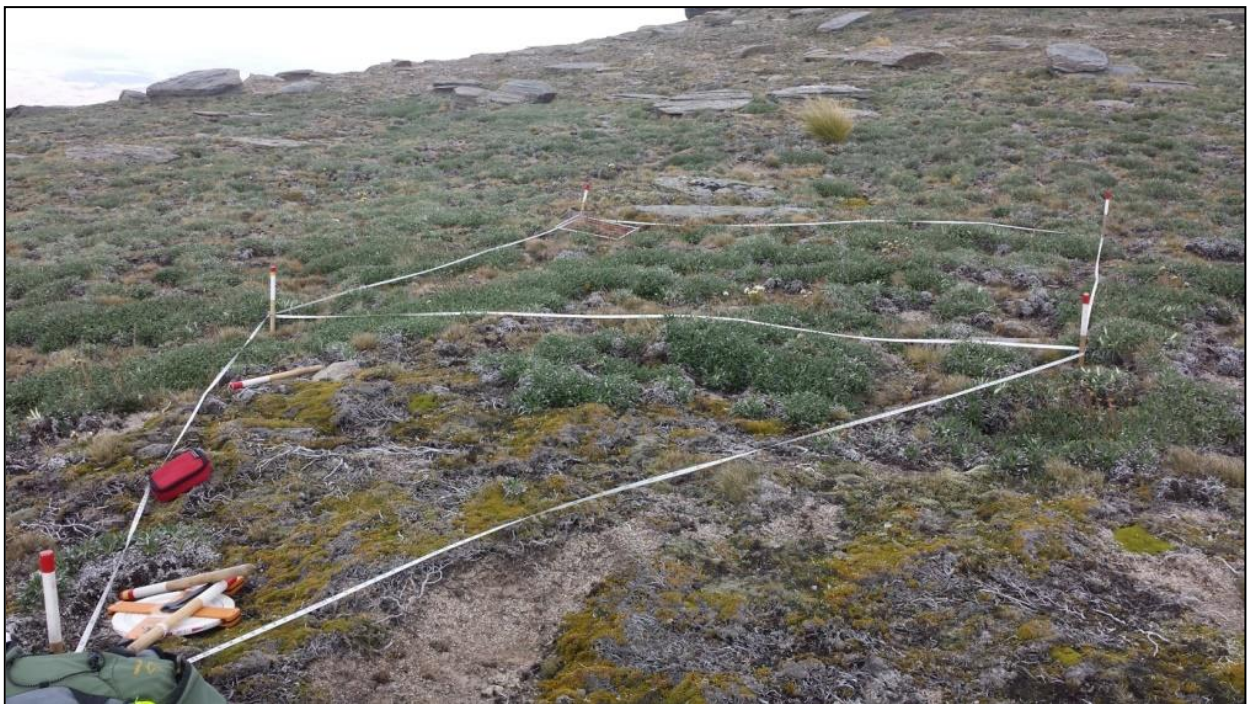
Species-area quadrat sampling in alpine herbfield on the Rock and Pillar Range, Otago.