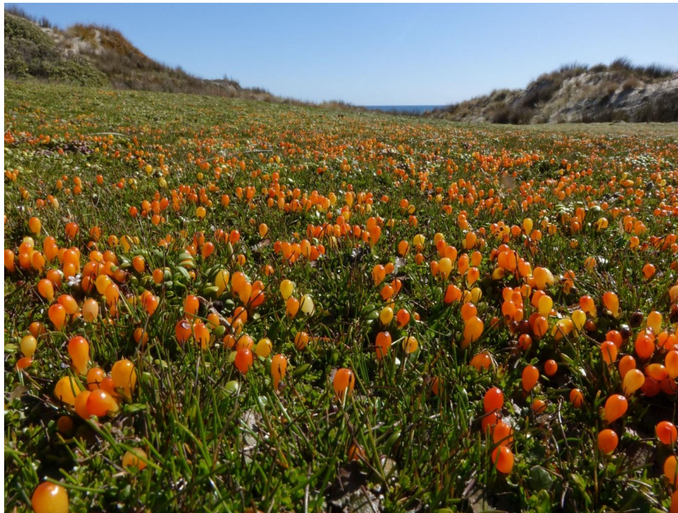
Nertera balfouriana fruits, Little Hellfire dune slacks