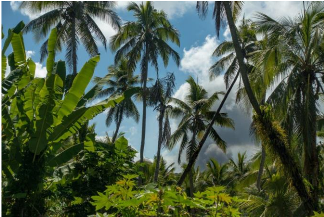
'Ash through the Palms' (Jaz Morris)

volcanic eruption spewing an ash cloud, viewed through a veil of palm trees (Ash through the palms, Jaz Morris). Here the sunny day produces vibrant greens through the fronds and other leaves as well as a clear blue sky, allowing the observer to clearly see the dark cloud rising. When the palms in the foreground are compared with the palms in the background the observer gets a sense of the depth of the photo.