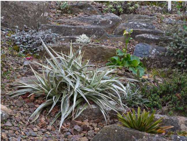
A view of the garden in September 2017. Astelia nivicola occupies the foreground and Celmisia brevifolia is partially visible at the top of the frame.

Further New Zealand alpine plants have added to the garden over several years and the collection now includes Celmisia mackaui , Celmisia brevifolia , Celmisia viscosa , Celmisia semicordata hybrids, Celmisia walkeri , Hebe