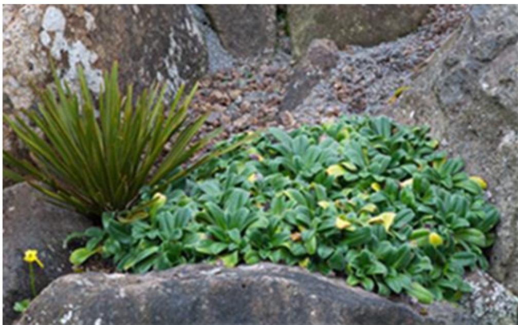
Myosotis capitata growing in the second crevice garden with Aciphylla Kirkii and Ranunculus monroi , September 2017

It is possible to grow a selection of alpine plants in a Dunedin garden. It is essential to choose a site that stays cool in summer and does not dry out. Good drainage is essential but the type of soil or substrate used is not so critical as long as it drains well and the roots of the plants growing in it do not become waterlogged.