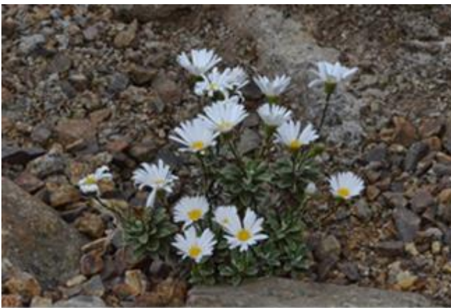
Celmisia brevifolia in flower, October 2013