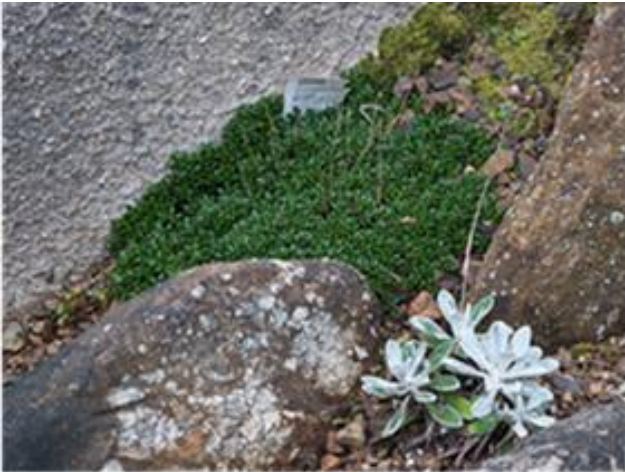
Celmisia bellidioides growing in the second crevice garden with Celmisia allanii , September 2017. The side of the concrete water tank can be seen on the left side of the photo. Note the placement of the stones against the side of the tank forming a narrow crevice.

build the second crevice garden faces east and gets only morning sun. It lies against the base of a large concrete water tank. Water running off the top of the tank flows down the side into the substrate which is a mixture of soil and brown metal keeping the ground moist but the slope enables any excess water to drain away. I planted Bulbinella rossii , Ranunculus lyallii , Ranunculus monroi , Celmisia bellidioides , Celmisia prorepens , Celmisia allanii , Anisotome