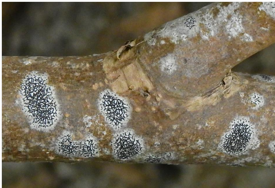
Script lichens on the trunk of Coprosma rigida, by Little Hoopers Inlet salt marsh.