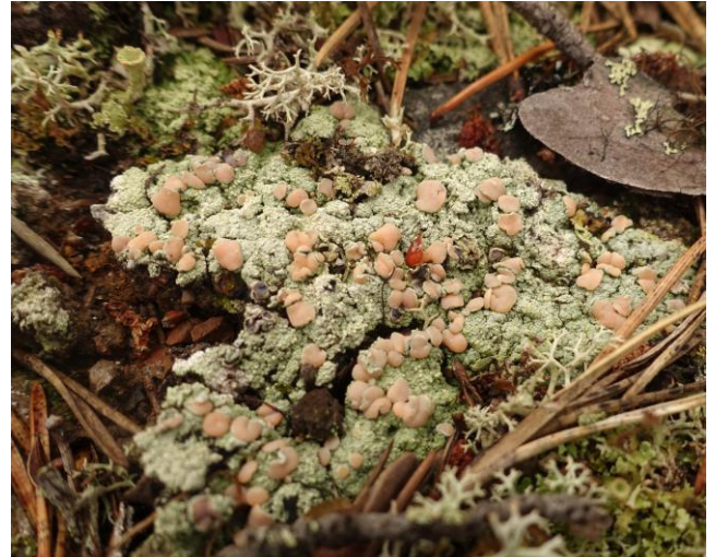
Icmadophila ericitorum , the “fairy barf” lichen, on decaying wood in conifer forest, Lapland

and some beside the Silver Peaks track. Most interestingly, he discovered that this lichen can reproduce asexually as well as sexually, and changes from one state to the other depending on the moisture content of the soil.