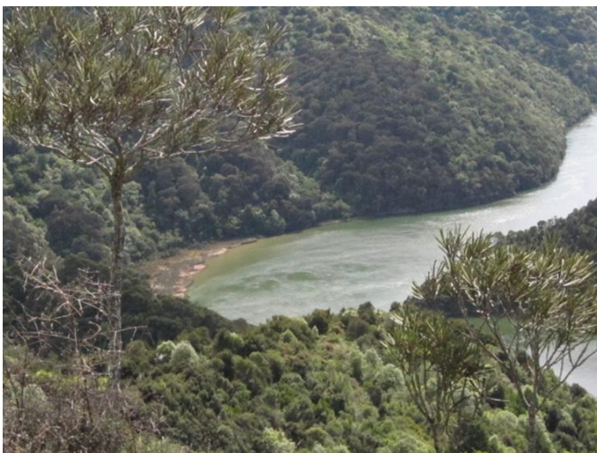
Pseudopanax ferox above Taieri Gorge