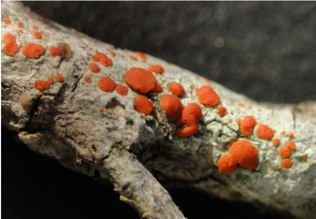
The crimson dot lichen, Ramboldia laeta , on a dead twig by the track round the salt marsh

family. Perhaps the most striking among the many crustose twig lichens was the crimson dot lichen, Ramboldia laeta (previously called more descriptively Pyrrospora laeta ), with its bright red fruit.