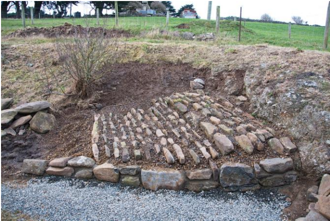
The finished garden with the first plants in place, June 2011.