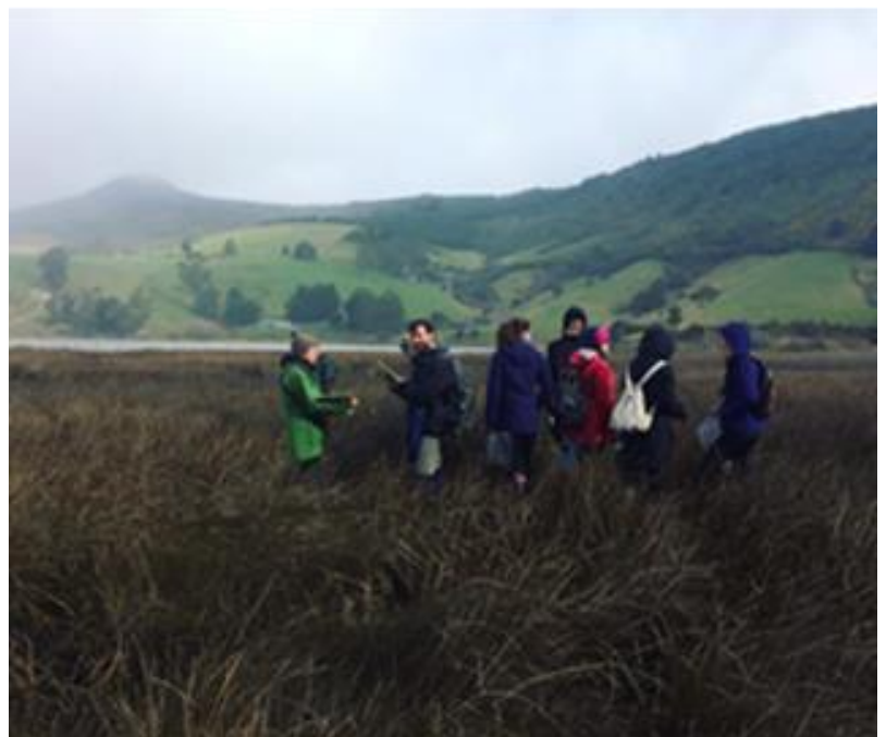
Conducting a 5-minute bird count amidst the marsh.

AAPES are a diverse bunch of enthusiastic students interested in, or studying many aspects of ecology and biology. Their members learned a great deal about native and exotic plants and birds. They organised an enjoyable trip out to Purukaunui Inlet and despite working in some boggy ground, most of us were able to keep dry feet.