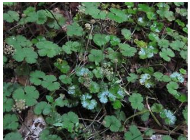
Hydrocotyle elongata

The gorge on the south side traverses a series of ridges separated by five steep sided gullies each of which is rich in ferns and bryophytes, but gave way often to stands of Kunzea robusta (rawirinui) and broadleaved shrubs, likely indicators of previous fire and at each such area the mycorrhizal-fungus, Cortinarius rotundisporus , featured on the front cover, occurred. The richest of these gullies, John Bull's Gully, with Hydrocotyle elongata , marked the halfway point only for us to find the rest of the group well and truly over their lunch break. This was where the ships from Dunedin disembarked their loads and passengers for smaller vessels heading through the gorge. John Bull established a garden here, but, being winter, there wasn't any sign of the potatoes found on earlier trips.