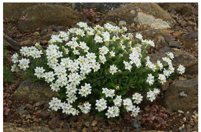
Myosotis saxosa in flower, November 2015

It became clear that I would not be able to grow many of the more sensitive alpine plants, particularly those that were less tolerant of drying, in this crevice garden so I looked round for a more suitable site. The place I choose to