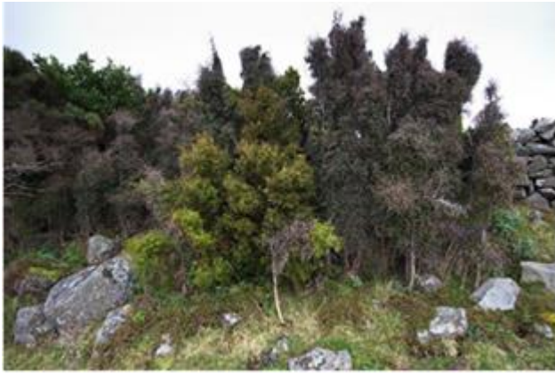
Open shrubland on Varleys Hill with young totara and Coprosma crassifolia