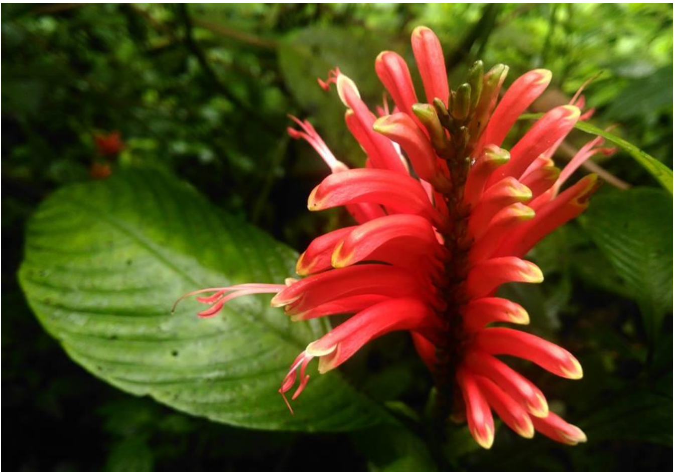
Razisea spicata