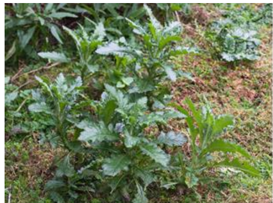
native groundsel, Senecio biserratus

We moved on up the hill through stands of dense kanuka ( Kunzea robusta ). The forest floor was dry and open with some good colonies of Asplenium hookerianum and also numerous individuals of the tree fern Cyathea dealbata . On the track margins the two native groundsels Senecio biserratus and Senecio minimus were abundant perhaps reflecting their unpalatability to the rabbits which judging by the sign present were also abundant. The exotic weed Nemesia floribunda was abundant throughout the Covenant. It is a common weed round Dunedin and has become rampant in the understory of these dry, coastal forests.