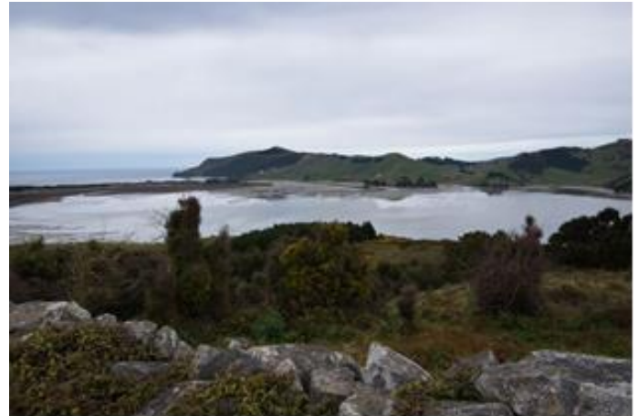
View of Hoopers Inlet and Sandymount from Varleys Hill

The top of Varleys Hill is enclosed by a circular stone wall built out of some massive stones some of which would weigh upwards of a tonne. We stopped for lunch, admired the view and speculated on the purpose of the enclosure. On the way home we added Coprosma virescens and Rubus squarrosus to the plant list. John Steel has compiled a plant list for the day which has added to the existing list for the Covenant. The number of lichen records has increased from 0 to 33 thanks mainly to the efforts of Allison Knight. Eighty-eight observations of plants, lichens and fungi covering 66 species were added to NatureWatch from the day's activities. Our thanks to everyone who participated in the field trip and to our hosts Moira and John Parker for allowing us to visit their special property.