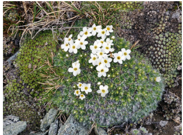
Myosotis pulvinaris , Old Man Range.

location. Psychrophila obtusa and Ranunculus pachyrrhizus were emerging from the snowbanks and flowering. Chionohebe densifolia was in full flower with many of the emerging flowers showing a delicate mauve colouring. On the dryer ridge crests the cushions of Chionohebe thomsonii were in flower. The related species Chionohebe glabra , which grows in damper places at the base of tors, was not yet flowering. The cushion forget-me-not Myosotis pulvinaris was also flowering. This plant appears to be short-lived and in good years the flowers can entirely obscure the foliage.