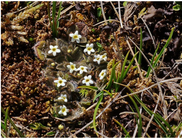
Myosotis pygmaea var. drucei , Old Man Range.

Further down the range on the eastern side I found some plants of Pachycladon novae-zealandiae growing in the gravel by the side of the road an unusual habitat for this species, which is usually grows in crevices in rock tors. The foliage of these plants was very dark almost black. There is a large population of Celmisia brevifolia growing close to the road, which seems to mass flower every year and is always a spectacular sight.