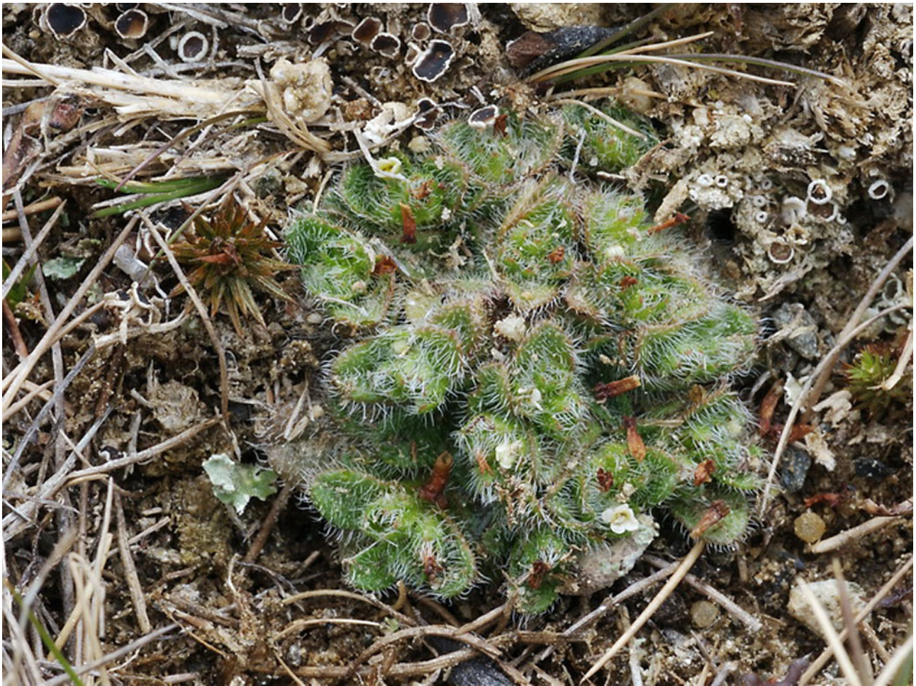
Myosotis pygmaea var. minutiflora , Old Man Range.

to make the collection. On this visit I found another Myosotis , Myosotis pygmaea var minutiflora , which as its name suggests is a tiny plant with inconspicuous flowers. It was growing in the exposed cushion field rather than in the wet sites favoured by Myosotis pygmaea var. drucei . Celmisia sessiliflora was in flower as was Kelleria childii .