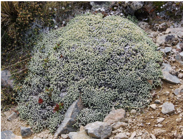
Raoulia petriensis , Ida Range.

We took advantage of the settled weather to visit this area with some of our Auckland Bot Soc friends on our way back to Dunedin after the Bannockburn camp ended. The northeast part of Otago is distinct from the rest of Central Otago geologically and botanically. Pimelea traversii was abundant and flowering profusely. Raoulia petriensis a distinctive species found only in North Otago and South Canterbury was also flowering.