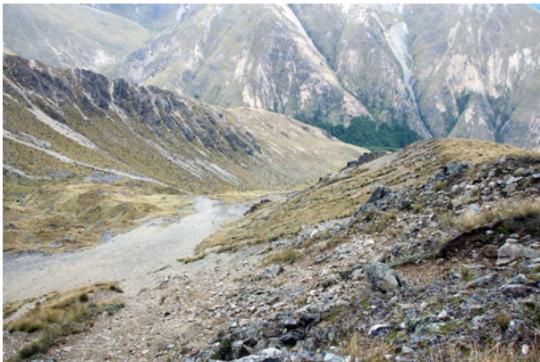
Hummock Peak Eyre Mountains showing habitat of Ranunculus scritchalis .

growing in rock crevices out of reach of browsing animals and photographers. We eventually got to a scree and found the plants we came to see. Ranunculus scritchalis is an Eyre mountain endemic. It is a very curious plant; the leaves are covered in conspicuous white hairs and appear almost black. The flowers are lemon-yellow and tucked down in the foliage.