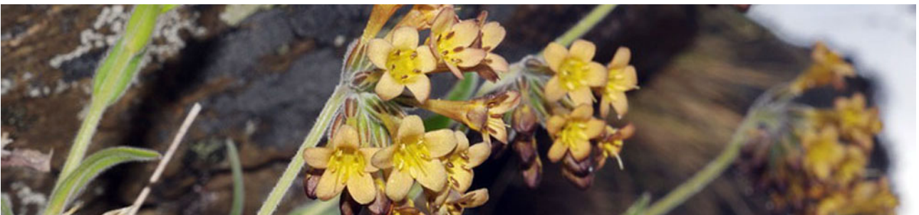
Myosotis macrantha , Hummock peak, Eyre Mountains.