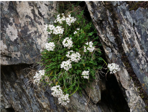
Pachycladon wallii , Hummock peak, Eyre Mountains.