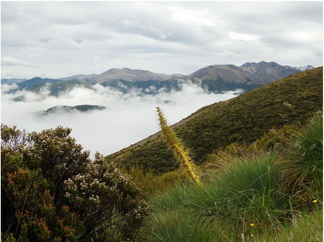
Aciphylla glaucescens , Mt Bee Eyre Mountains.

form of Celmisia semicordata subsp. stricta present but this year very few plants were flowering. The aim for the day was to find Celmisia philocremna , which is found only in the Eyre Mountains and grows on steep inaccessible crags. This entailed a 7 km walk along the ridge to some rock outcrops above the Cromel, which was eventually accomplished and some flowering plants located along with Raoulia buchananii , Leucogenes grandiceps , and Stellaria roughii . As a bonus we found two plants of Pimelea poppelwellii a rare species that is also found on the Hector and Garvie Mountains and can easily be mistaken for Hebe odora when it is not in flower. All that then remained was to walk 7