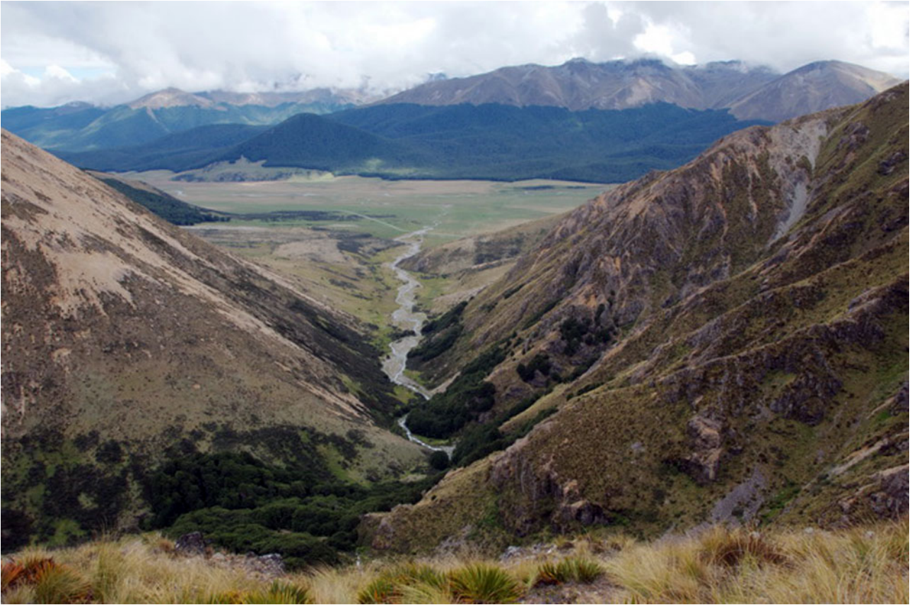
Gorge Creek, Eyre Mts.