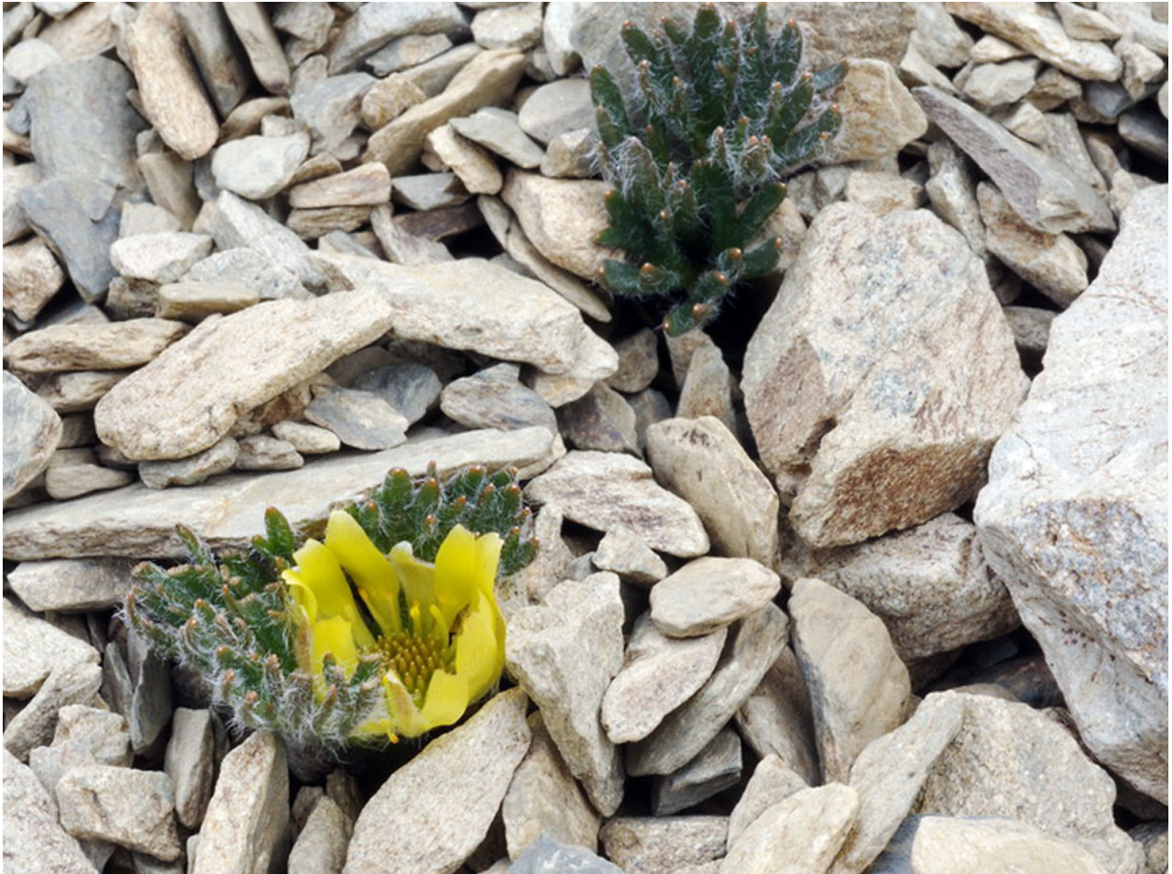
Ranunculus scritchalis , Hummock Peak. Eyre Mountains.

‘Lomond’ was a conspicuous component of the mixed tussock shrubland vegetation. We also found the rare native dandelion Kirkianella novae-zelandiae and the orchid Thelymitra cyanea at this locality.