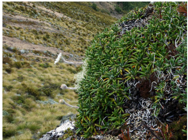
Celmisia philocremna, Mt Bee, Eyre Mountains.

down I found Parahebe decora growing in gravel in eroding gully. The Eyre Mountains have some marvellous plants but are not a place for the faint-hearted as the terrain is steep and bony. A week after our visit, a friend from Invercargill who was following in our footsteps dropped his camera bag containing his cell phone and car keys over a bluff. After a fairly anxious 40 min search he retrieved it from the middle of a large Aciphylla .