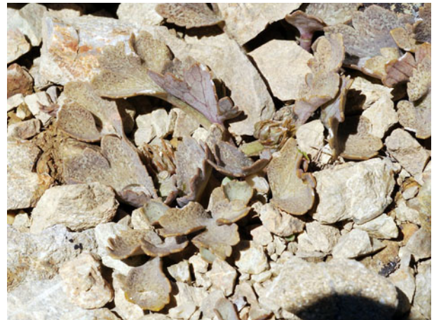
Ranunculus crithmifolius, Ida Range.