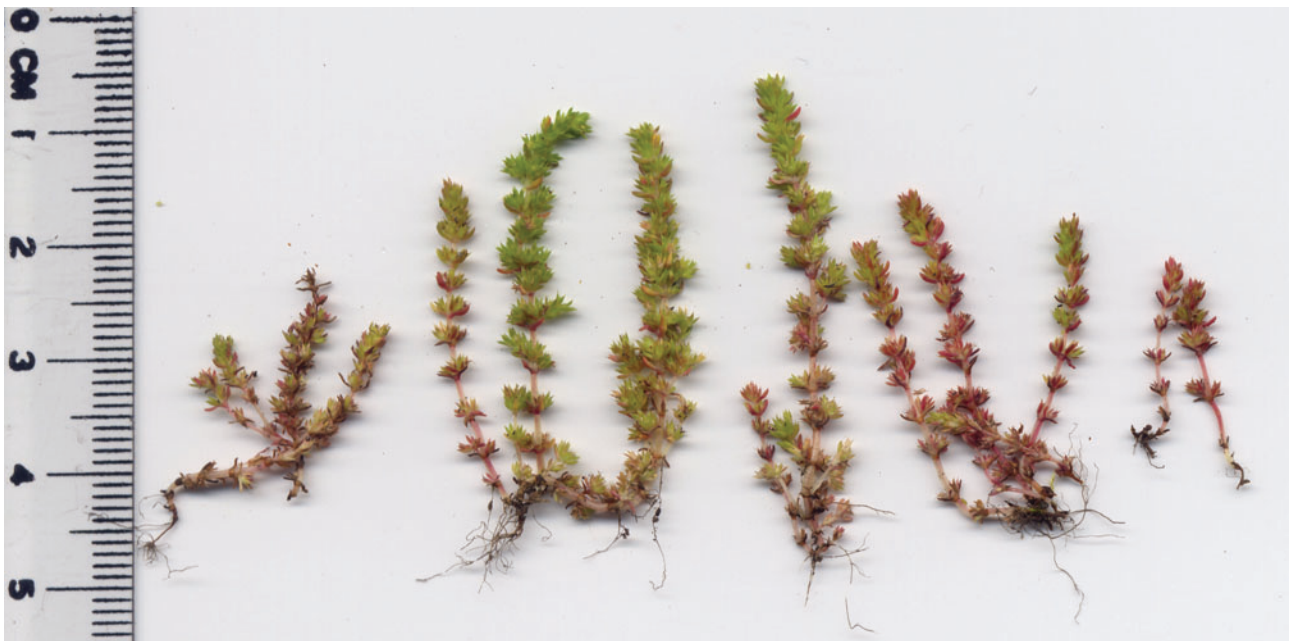
Cultivated plants of Crassula alata collected from Waikouaiti

and distribution of Crassula alata and concluded that it is “now widely established in the south-western North Island, at least, and perhaps elsewhere.” Ogle (2008) stated that this European species was first recognized in New Zealand from material sent live from him to Dr Peter de Lange, who lodged it in the herbarium at the Auckland Museum (AK). Subsequently however Dr de Lange has been through other material in AK and found a specimen of C. alata , filed as C. sieberiana , that he collected in Hamilton in 1998 (Colin Ogle pers. comm). That, therefore, becomes the first NZ collection of C. alata .