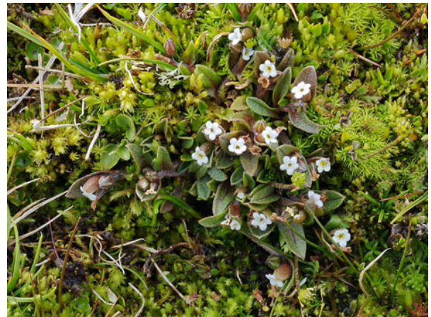
Myosotis tenericaulis Old Man Range.