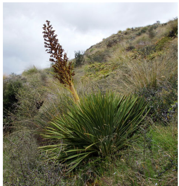
Aciphylla aff. horrida Lomond North Marvora Lake.

Mike also found Myosotis pygamea var glauca , which we had seen previously in the Nevis Valley by sitting on it at lunch time. My favourite Melicytus , Melicytus aff. alpinus 'Ida'. It seems to be a distinctive form adapted to a scree habitat. Colobanthus acicularis looking very much like a vegetable hedgehog was growing in the scree along with scattered plants of Senecio glaucophyllus subsp. discoideus .