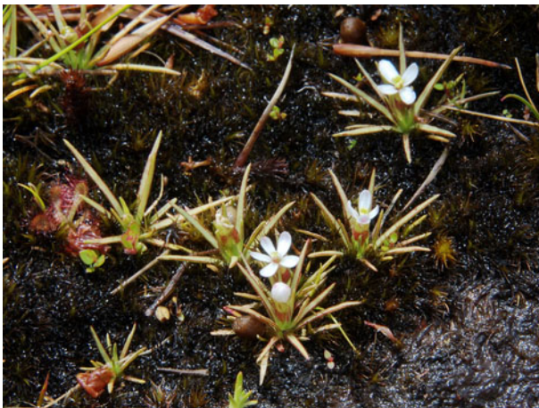
Oreostylidium subulatum Waituna wetlands.